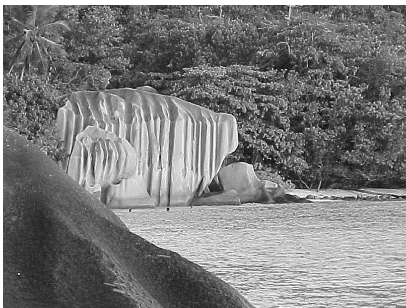
Figure T46 The tor at Anse Source D’argent, La Digue Island, Seychelles, Indian Ocean; often considered to be the most beautiful beach in the world (Photo courtesy of New Adventures).

La Digue Island has long been known for its world-class resorts featuring tropical flora, white-sand beaches, swimming in crystal clear waters, snorkeling among coral reefs and magnificent scenic views. Anse source d’argent beach, located on the island, is the site of several tors, chief among them that is pictured in Figure T46. The size of the pink tor can be judged when compared with the heads of the three swimmers seen in the mid-foreground. Graphic too is the weathered “fluting” described as typical of tors by Linton (1955) in his pioneering work, and by Brathwaite (1984) for a tor on Mahe.